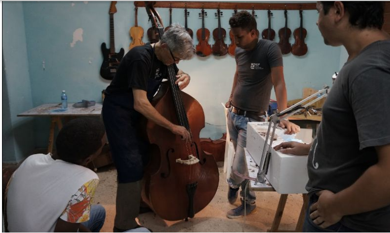
El Taller and the repair team throughout the years!

We had a makeshift taller at La Ena school the first year I traveled with Horns to Havana. Customs did not allow any of our tools to be released until two days before we were supposed to leave, so we ended up working with the few personal tools we had put in our suitcases like a pocket knife! We made work benches out of abandoned doors that we rested on sawhorses. We had to go to the principal's office just like the students to get water or use the restroom. That first trip was exhilarating and fun and made us realize how inventive Cubans are, and we could be too. We had so much fun that we insisted on returning for nine more years and hope to do so again very soon. The shop has made over 7000 repairs by now. Happy 10 years, Horns to Havana – what an incredible journey!